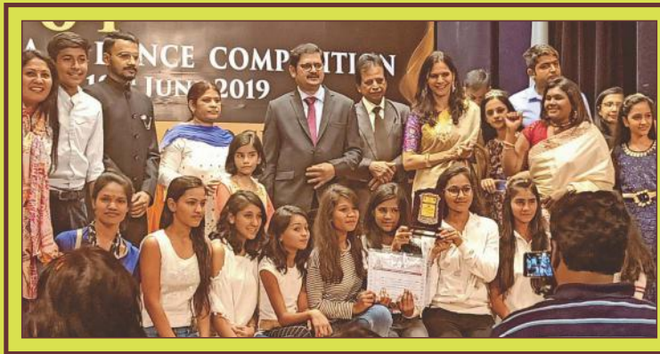
Bagged 3rd Prize in National Dance Competition at Shimla