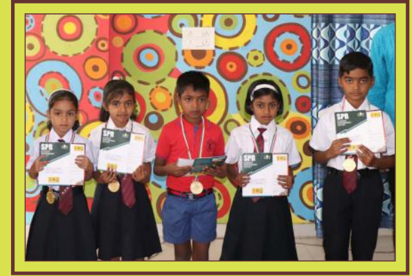
Science Olympiad Winners