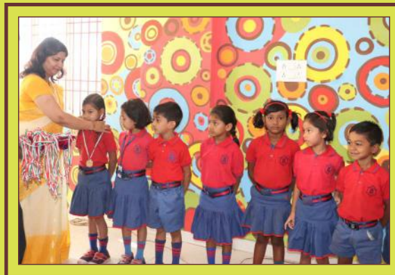
Science Olympiad Winners