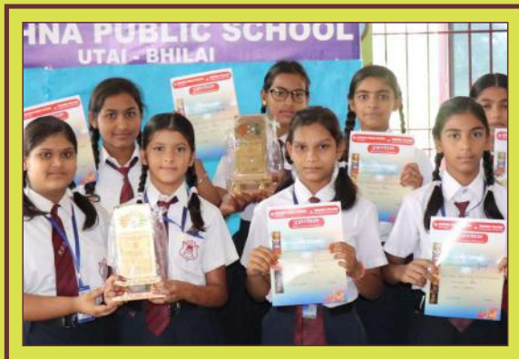
National Level Dance Competition Winners