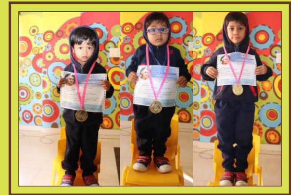
National Drawing Competition Winners