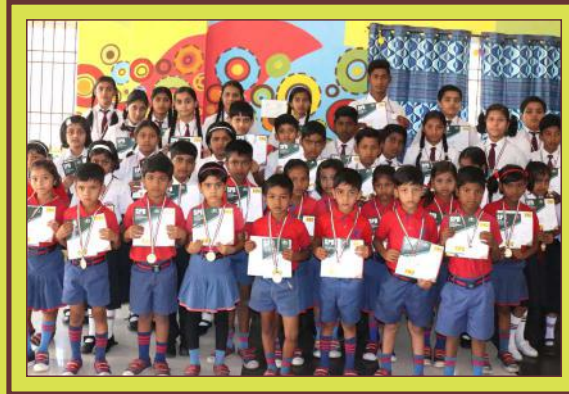
Science Olympiad Winners