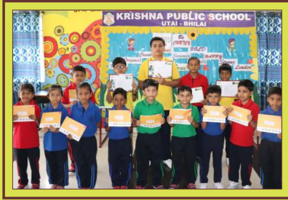
Science Olympiad Winners